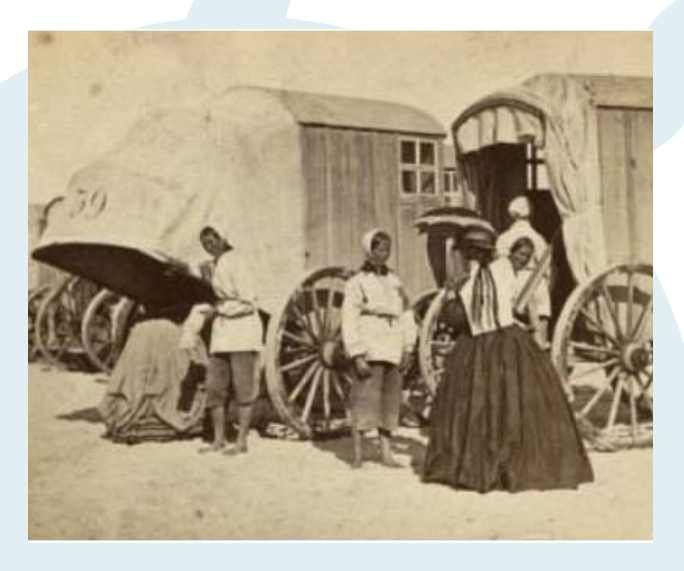
Prudery on the beach of Norderney: bath carts protect high-necked clothed people from the public eye.

During the Biedermeier period nudity was considered very indecent. People wore swimwear, which covered almost the whole body, also for men. Yet, even in this veil public bathing was offensive. Already around the year 1800 there were the first bath carts: wooden dressing cabins with wheels driven into the sea, to protect bathers from the sight of others.